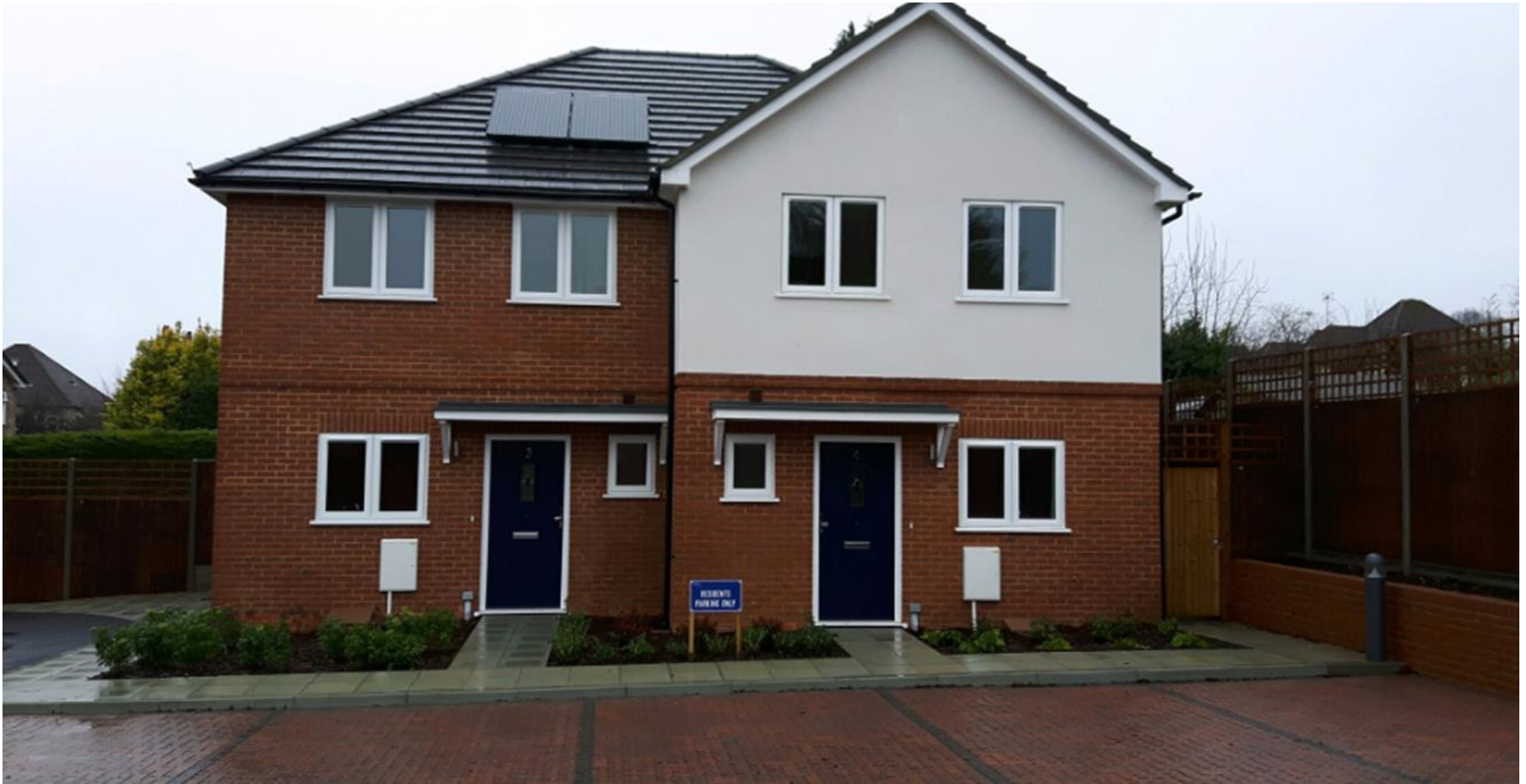
Middlefield, Farnham Development of 4 x two bed houses Completed January 2017